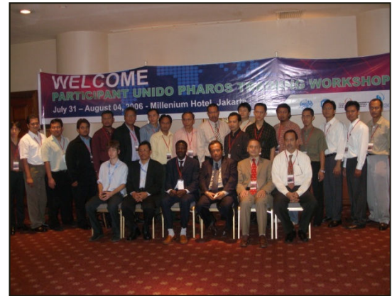
UNIDO Pharos Workshop for entrepreneurs and consultants, Jakarta 2006, Indonesia