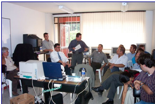
UNIDO Integrated Programme in Colombia, Pharos Workshop for Entrepreneurs, Pereira, Eje Cafetero, March 2003

The implementation includes relevant training and on-site assistance to the participating SMEs helping them to realize unique opportunity in developing necessary knowledge capital and business culture . The enterprises become better prepared to globalization impacts, financial downturns, develop capacity for controlling the business results, managing innovations and investments. The Programme facilitates effective path to implementation of ISO 9000 and other quality standards, supports certification and capacities for trade, exports, investments, access to markets and compliance to BASEL II credit risk minimization requirements.