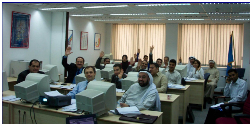
UNIDO Pharos Training Workshop, Manama, Bahrain