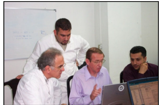
UNIDO – ELCIM Programme in Lebanon, Food Manufacturing Enterprise, Beirut 2004

The Programme can be managed by national or international organizations coordinating and supervising national consultants, running awareness seminars, promoting results, scheduling and monitoring the events and running the final conference.