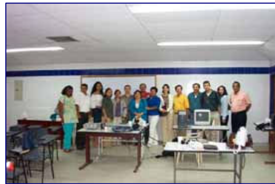
UNIDO Integrated Programme in Colombia, training workshop for industrialists, Barrancabermeja, March 2003

The framework of a Capacity Building Programme provides cost effective industrial modernization services to selected industrial enterprises (typically from 20 to several hundred) and enriches national industrial modernization strategies.